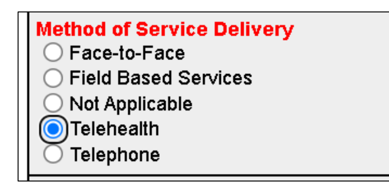
Figure 4: Progress note method of service delivery

Reminder: Method of Service Delivery refers to how a session was conducted. Select the appropriate method.