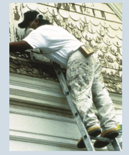
Take Home Lead (Jobs or Hobbies)