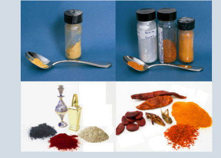
Traditional Remedies, Make-up and Powders