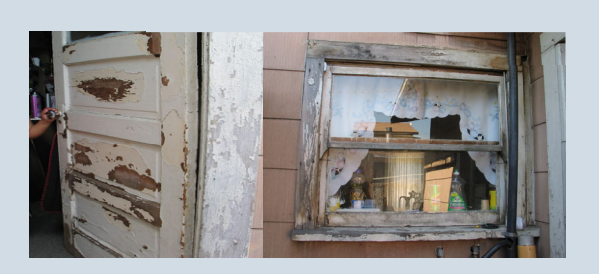
Paint in Homes Built Before 1978