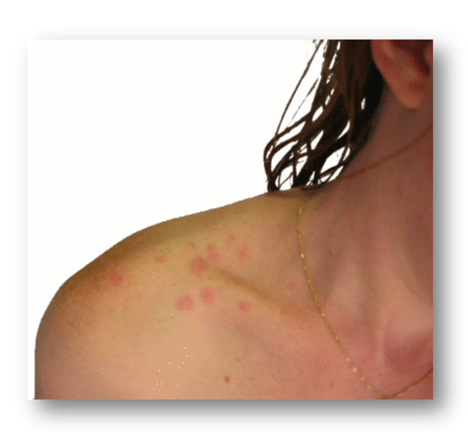
BB Bites on shoulder