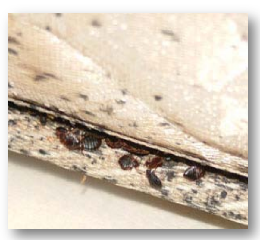
Bed Bugs along seam of mattress